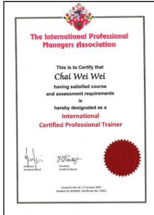
INTERNATIONAL CERTIFIED PROFESSIONAL TRAINER by IPMA, UK