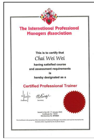
CERTIFIED PROFESSIONAL TRAINER by IPMA, UK