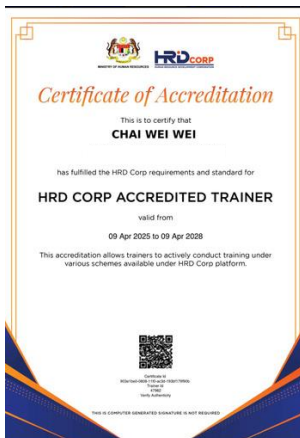
HRD CORP ACCREDITED TRAINER by HRD CORP MALAYSIA