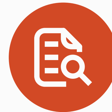
Business Model Canvas