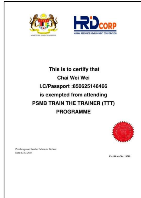
HRD Corp Exemption Trainer