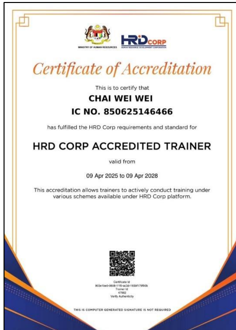
HRD Corp Accredited Trainer