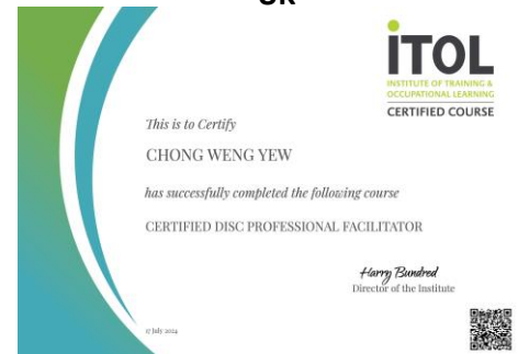
Certified DISC Professional Facilitator, Itol UK