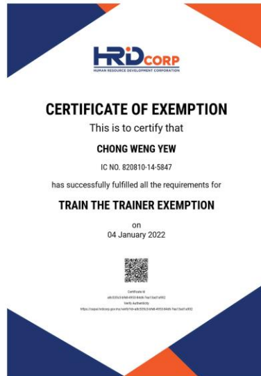
HRDC TTT Exempted, Malaysia