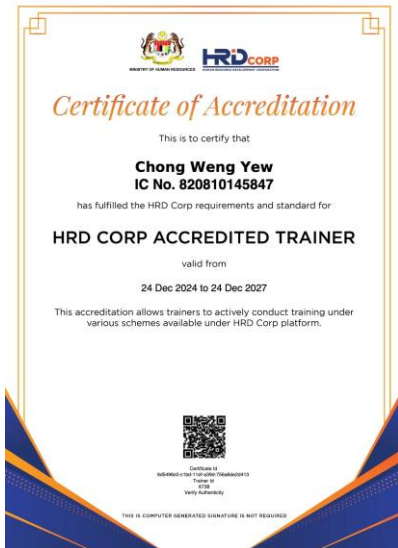
HRDC Accredited Trainer, Malaysia