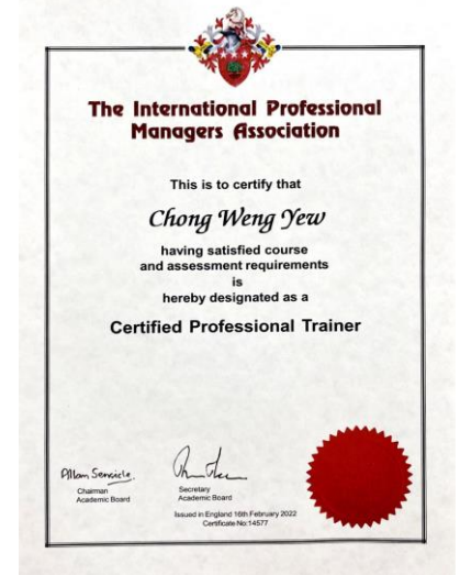
Certified Professional Trainer, IPMA UK