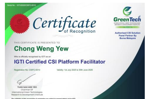
IGTI Certified CSI Platform Facilitator, Malaysia