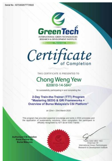
TTT Certification on "Mastering SEDG & GRI Frameworks + Overview of Bursa Malaysia's CSI Platform, Malaysia